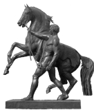
St. Petersburg Department of V.A. Steklov Institute of Mathematics

The conference is organized and sponsored by